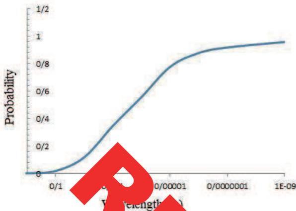
Fig. 6. The probability of the effect of waves on the evolutions of a DNA within a cell in terms of wavelength

The above probability depends on the wavelength of external fields.